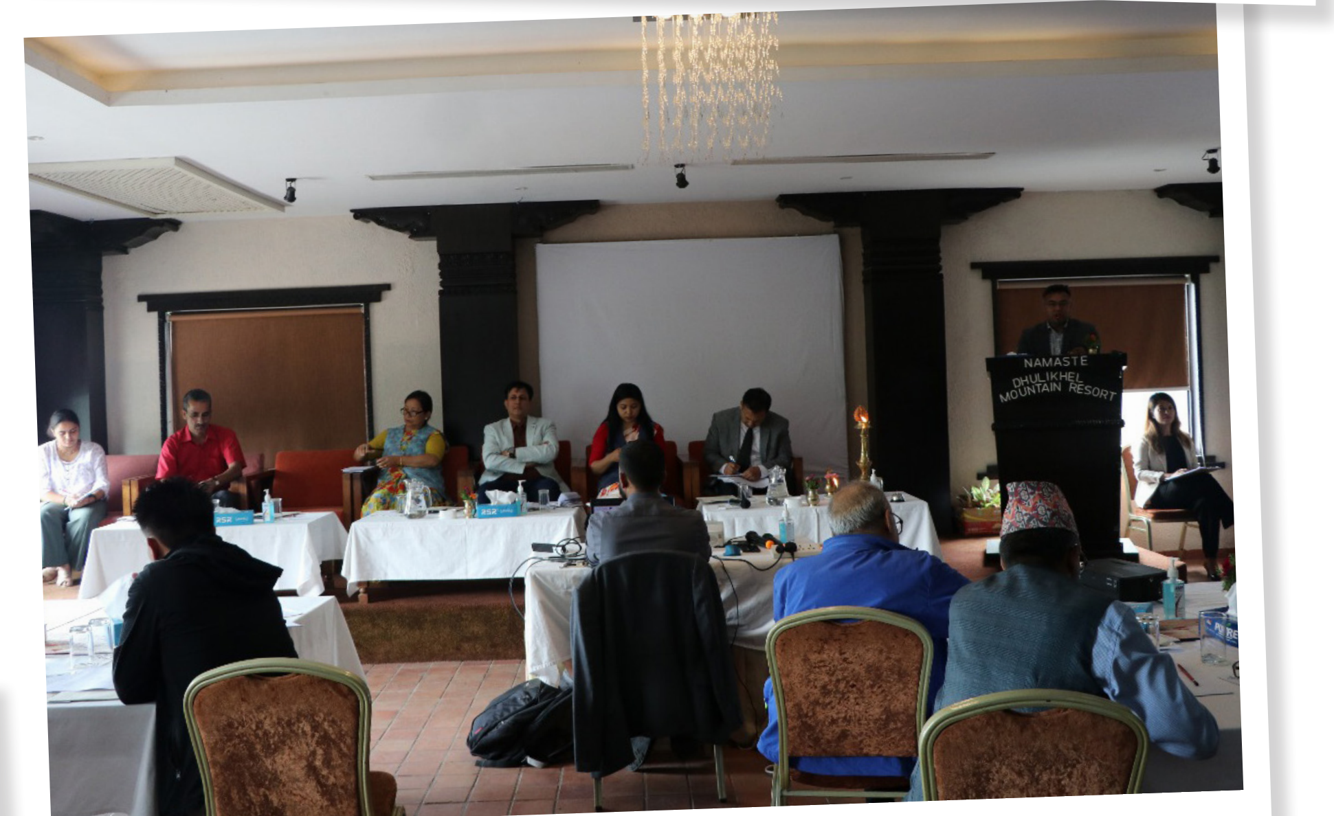
Bagmati provincial workshop