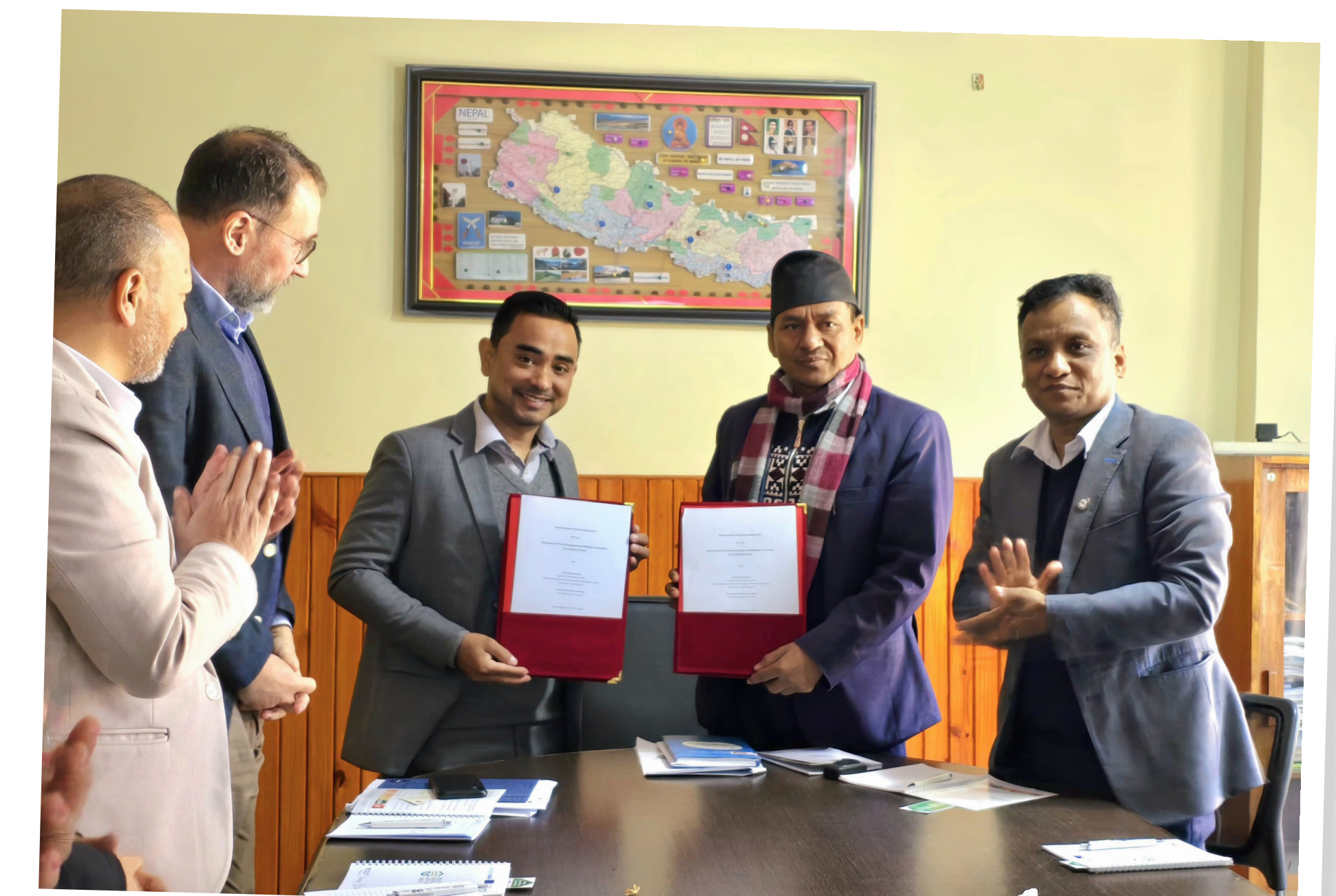
Memorandum of Understanding signing with DUDBC

Technical support to federal government to finalize Green Building Guideline for Nepal