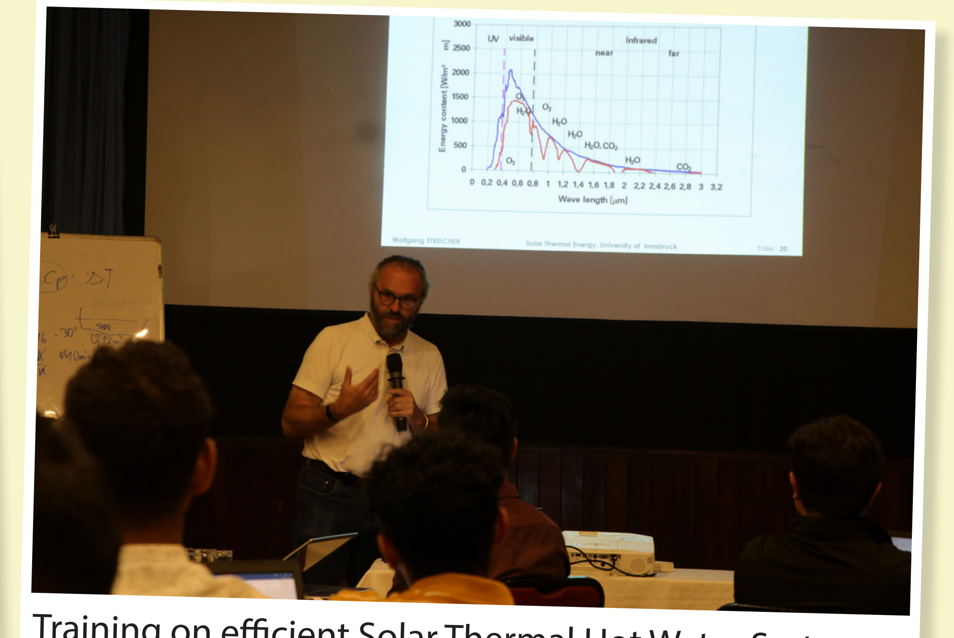
Training on efficient Solar Thermal Hot Water System