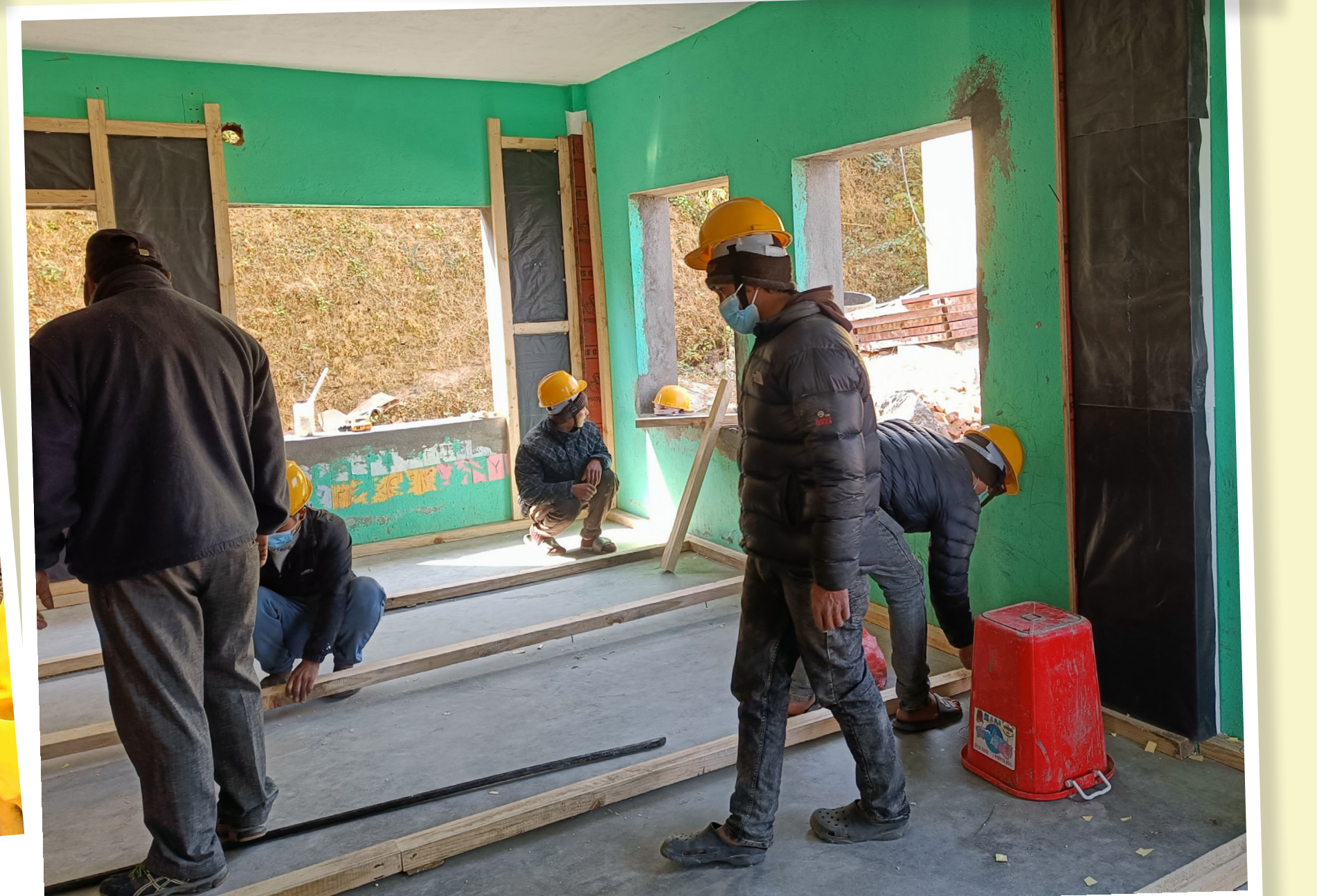
On-the-job training on energy retrofitting of a school in Dhunche, Rasuwa