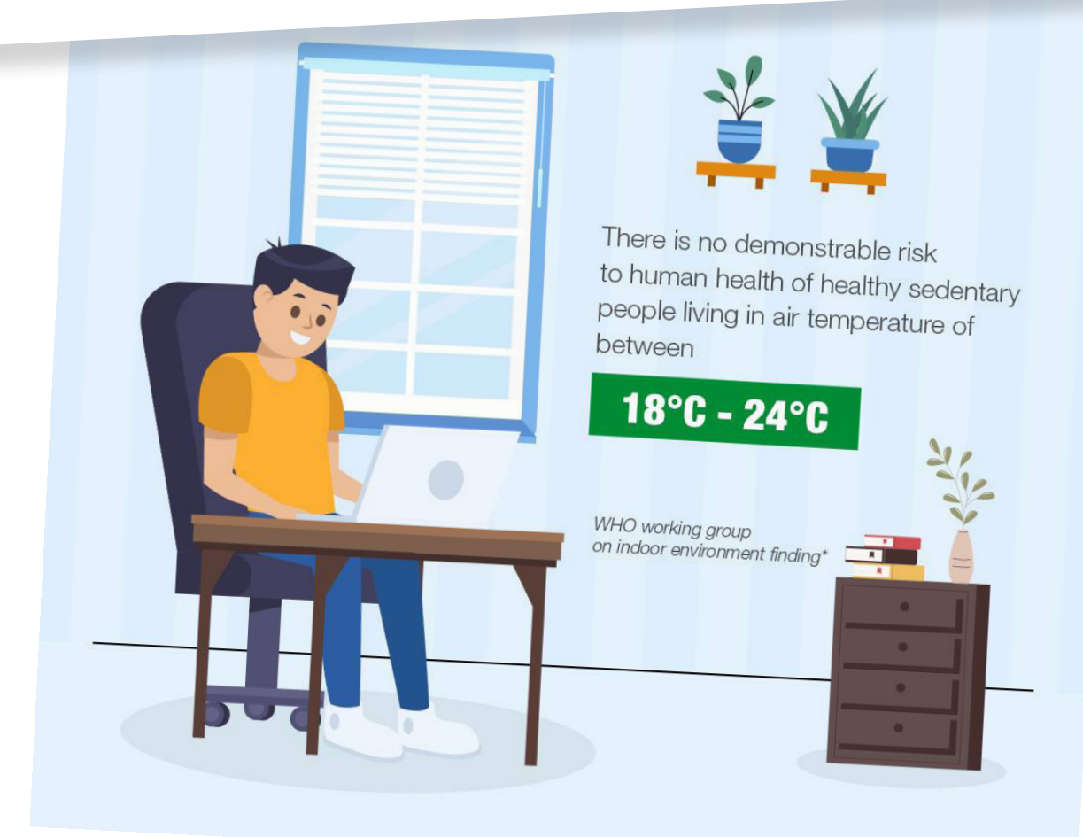
Digital awareness post