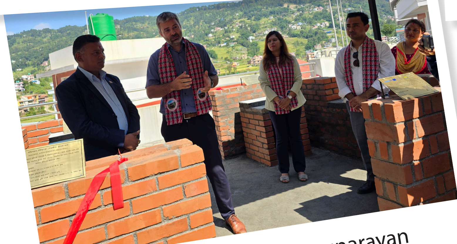
Demo wall handover to Changunarayan Municipality