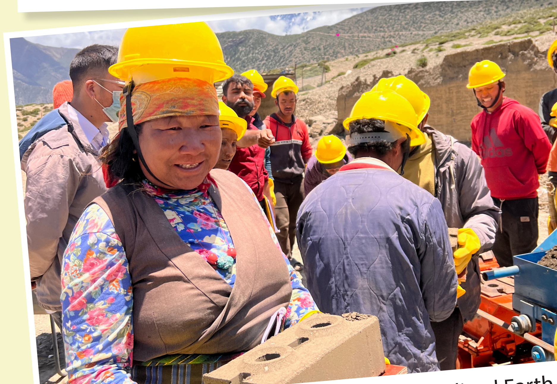
Training on production of Compressed Stabilized Earth Block in Mustang