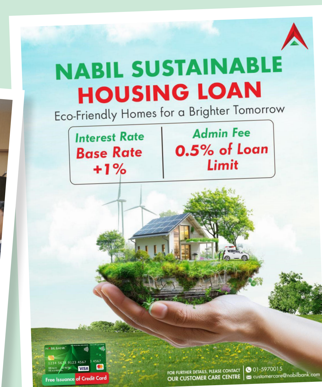
Nabil bank's Sustainable Housing Loan