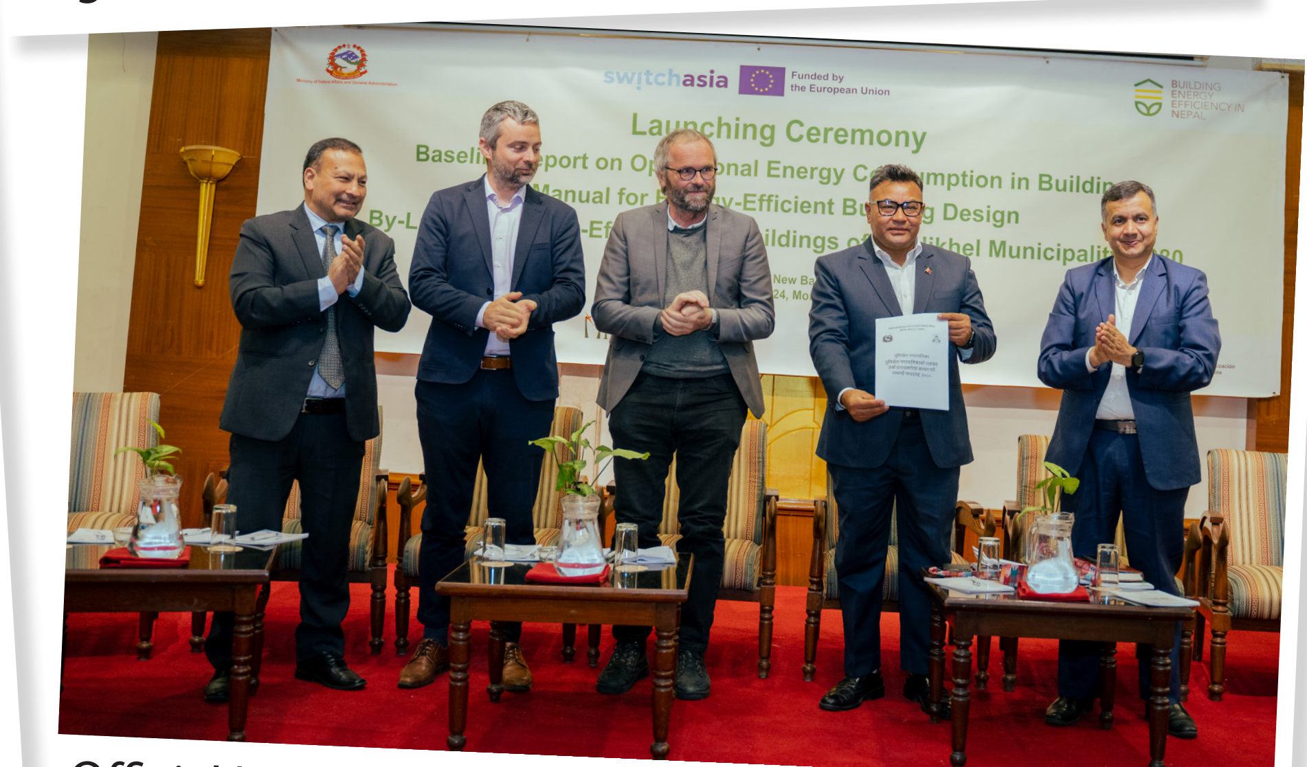
Official launch of by-laws, 2080 of Dhulikhel Municipality integrating energy efficiency