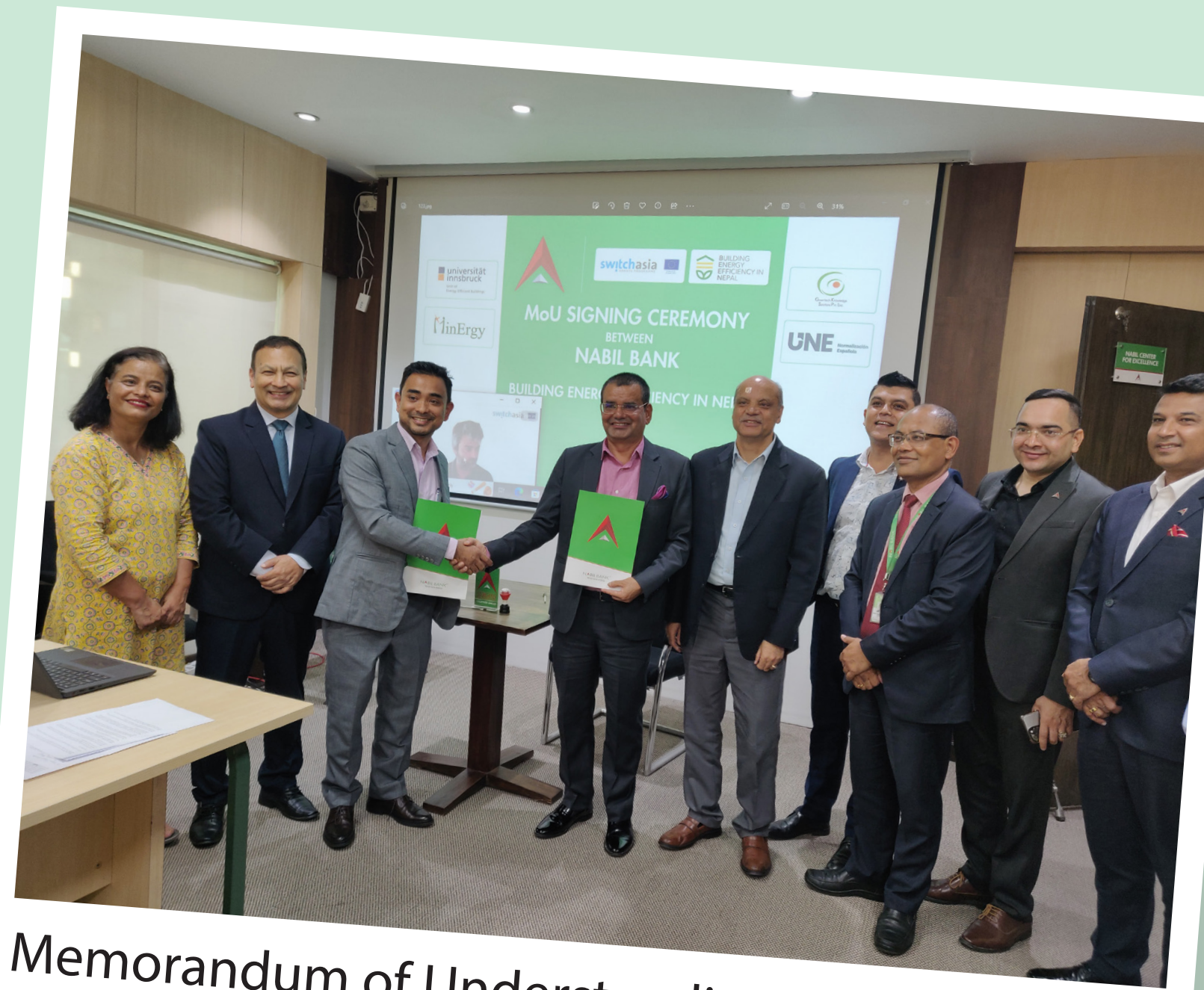
Memorandum of Understanding signing with Nabil Bank

Two of the largest commercial banks of Nepal are offering preferential loan to incentivise for uptake of energy-efficient buildings.