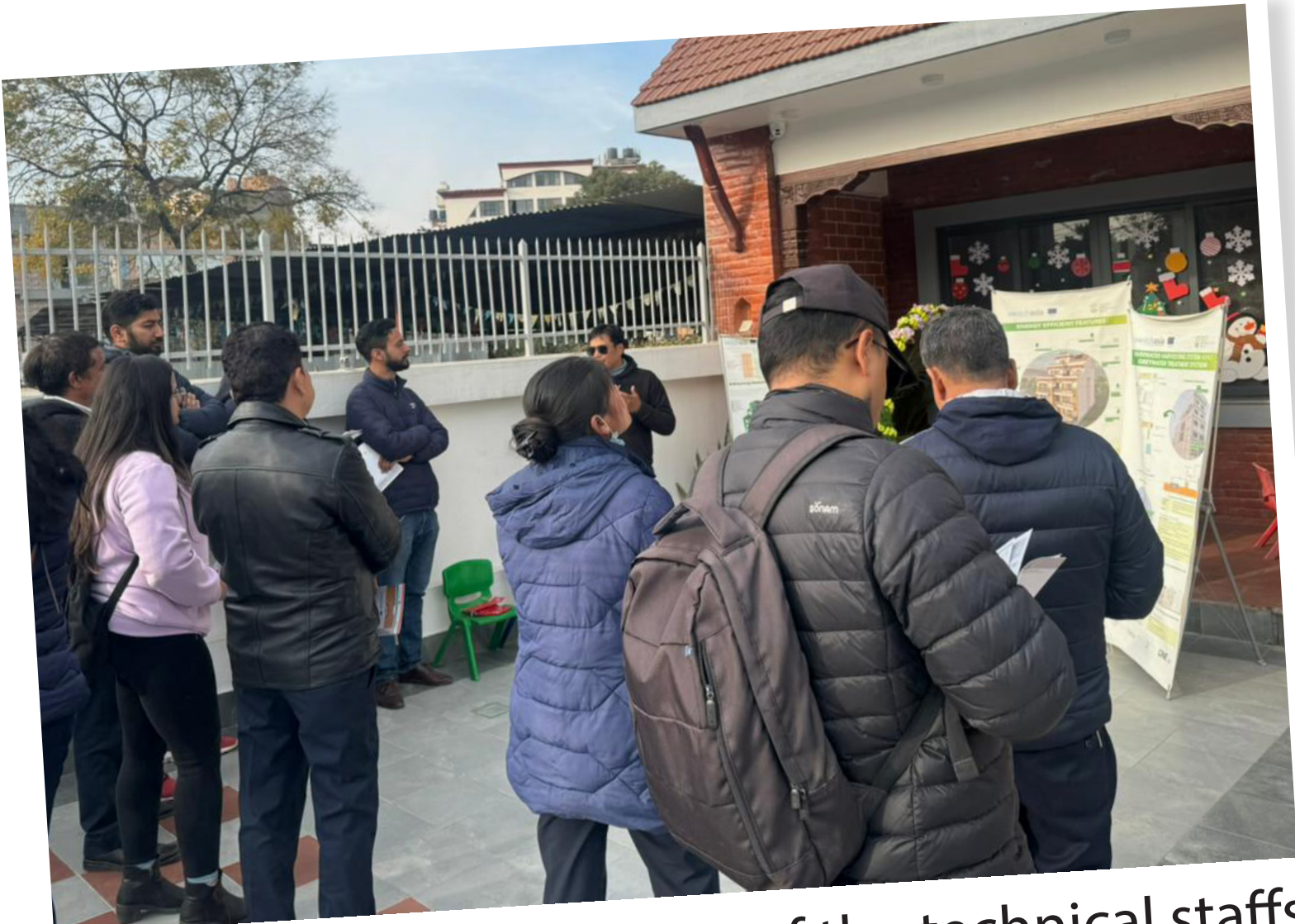
Visit to showcase building of the technical staffs of Gorkarneshwor municipality