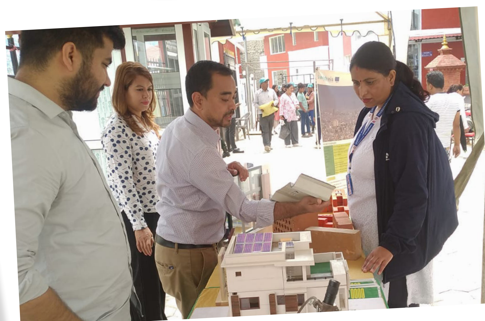
BEEN's Green exhibition in Changunarayan municipality for raising awareness