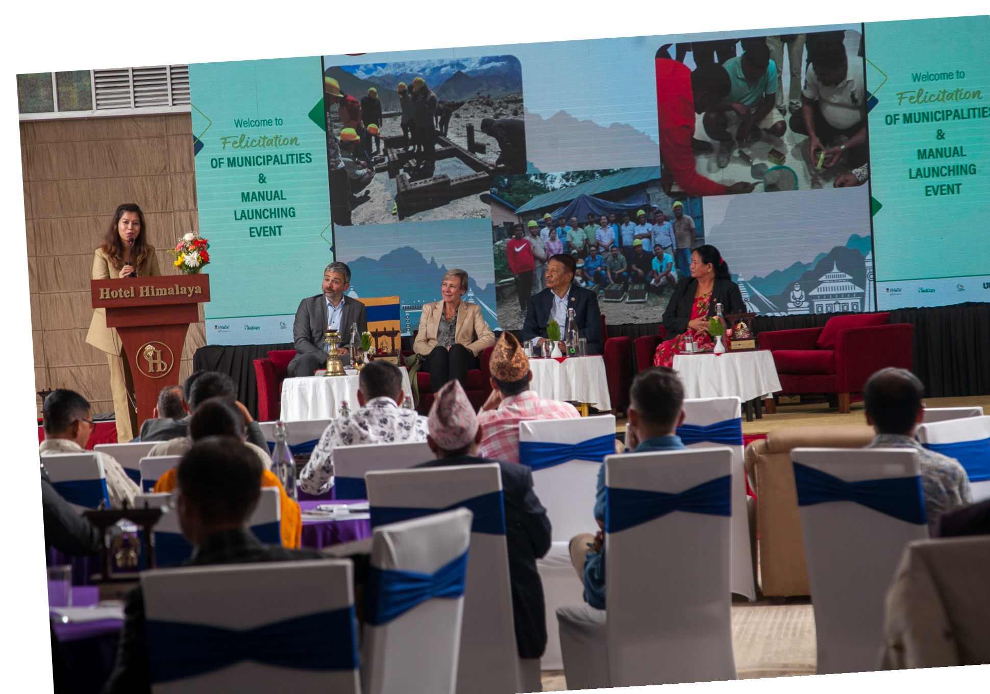
Felicitation of Municipalities