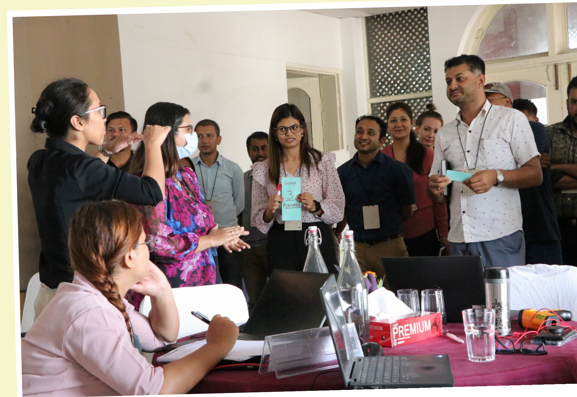
Training of Design MSMEs

158 buildings designed/built with energy efficiency & renewable energy measures.