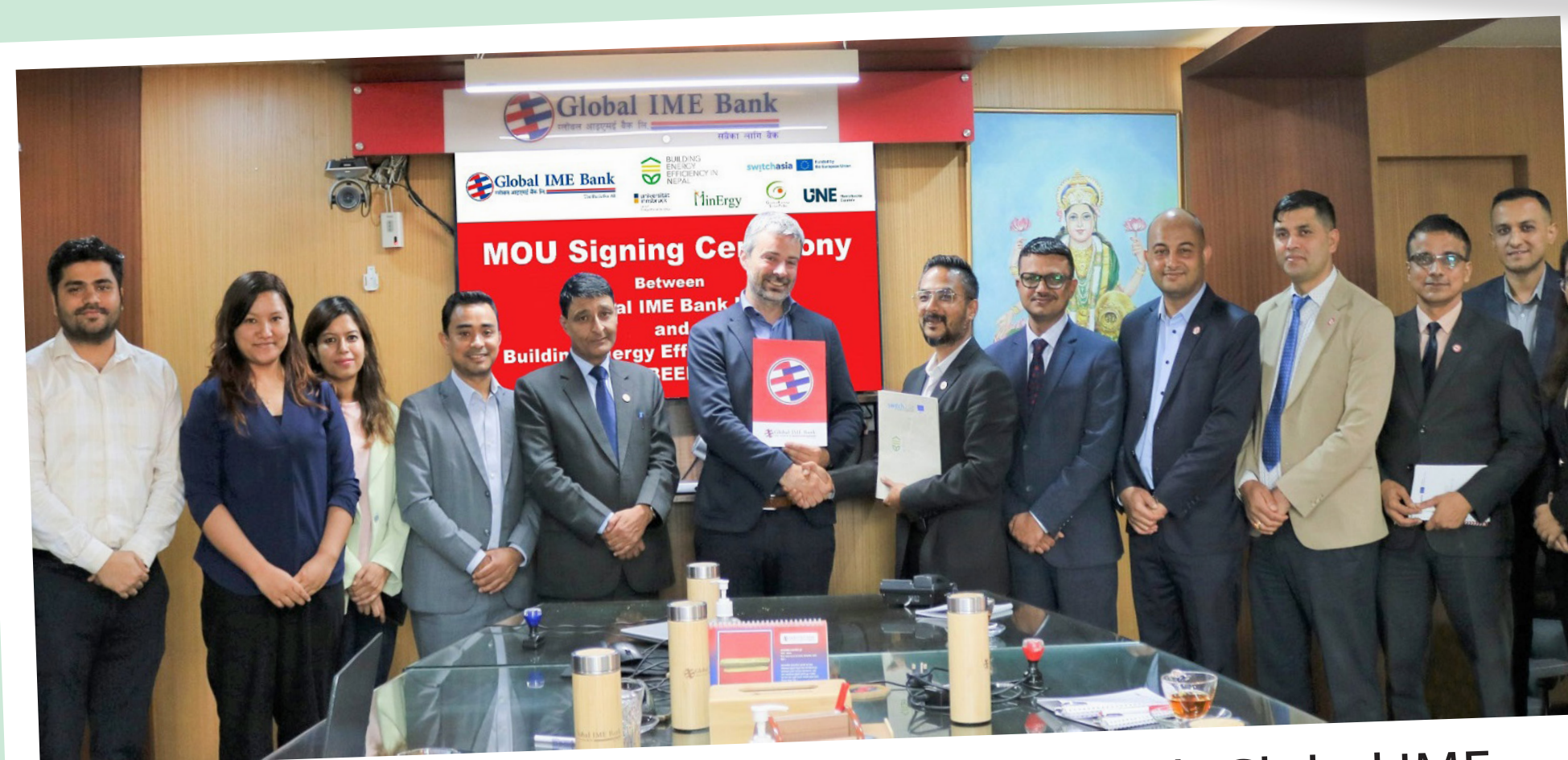
Memorandum of Understanding signing with Global IME Bank